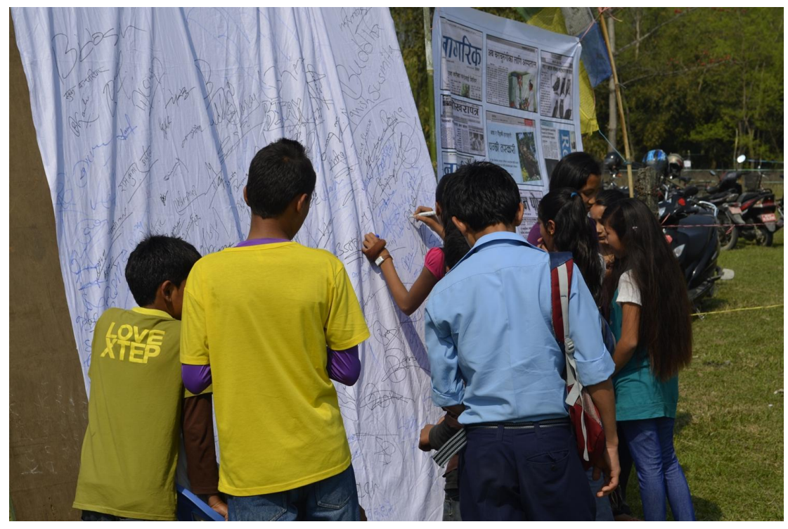
Local students signing for bird conservation

More than 600 signatures were provided to pressurize government and show solidarity to prohibit the use of catapults in Nepal. A study by Friends of Nature shows that approximately 30 percent of the students in Nepal use the catapult to kill/injure the birds (Including owls). This campaign was also targeted to garner the support of public for establishment of bird rehabilitation center in Nepal. Most of the captive and injured birds (mostly owls) die while trying to release in nature in absence of bird rehabilitation center.