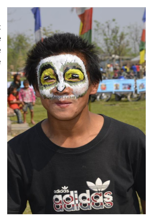
A teenager showing owl face painting

Owl face painting was one of the important events during the festival. This was an eye catching event that attracted lots of people especially children and teenagers who were very curious to paint owls in their faces.