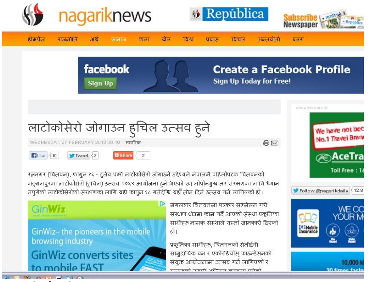
Example of media coverage

Owl is one of the hirds on the yerne of extinct in Nenal