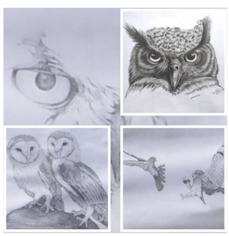
Sketches prepared by Sabita Gurung

A total of 10 sketches drawn by Ms. Sabita Gurung were kept for display during the festival. The sketches were one of the highlights of the festival as they drew all the visitors towards them. It is hoped that these sketches generated the conservation interest of the local people about the owls.