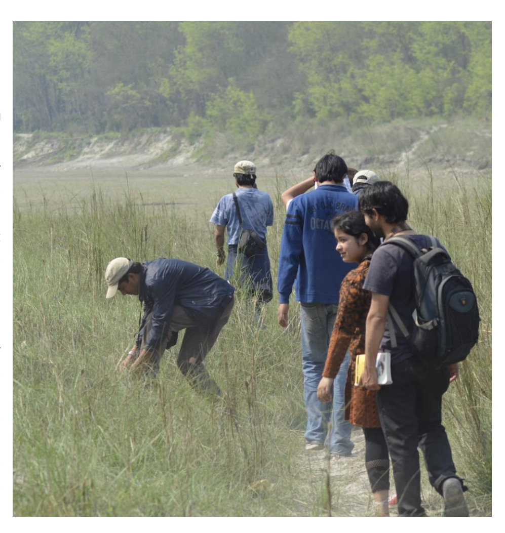
Looking for Tiger's pugmark

Nature walk was conducted on the third day of the 3<sup>rd</sup> festival i.e. March 2013. This was conducted for people who were interested to stroll inside the forest and explore the birds, mammals, butterflies and other natural resources. Tiger tracks along the bank of Narayani river and one horned rhinoceros sighting were the highlights of the nature walk.