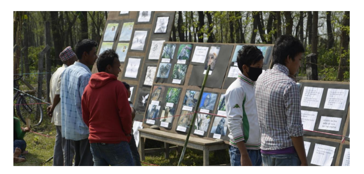
Participants reading information about owl's importance