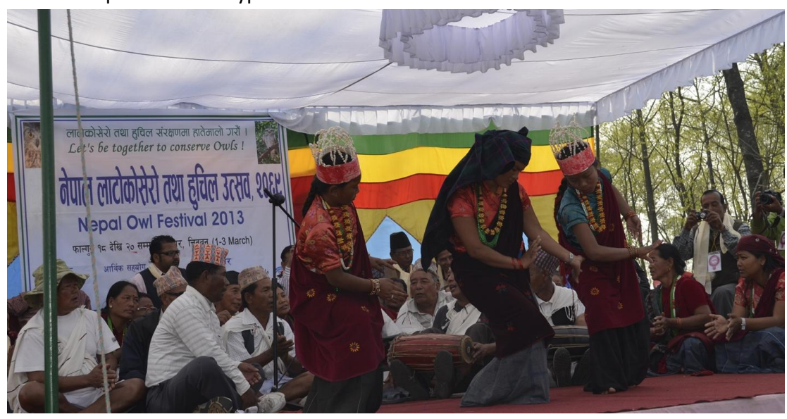
Local women performing the Ghatu Dance

A traditional dance of the ethnic Gurung people was presented on the second day of the festival. The dance is becoming very rare these days as new generation do not get a chance to experience this type of traditional dance environment.