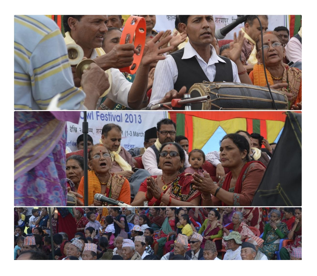
Singers and audiences of Bhajan song