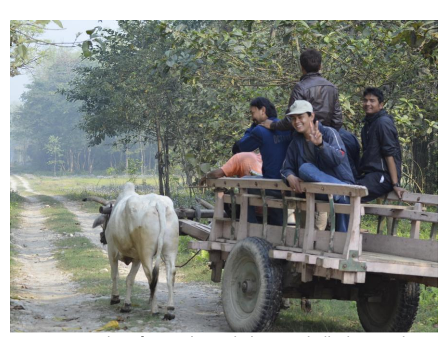
Looking for one horned Rhino via bullock cart ride

Bullock cart ride was also organized for the visitors during the festival. The bullock cart ride was initiated for people who would like to experience the rural setting while enjoying the natural wealth of the area.