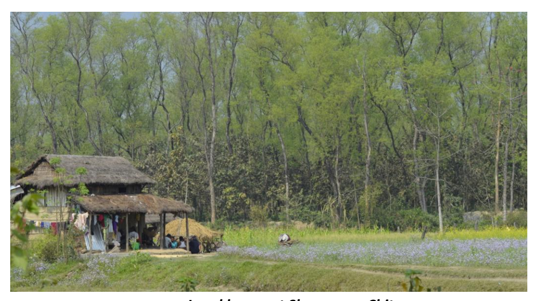
Local house at Sharanpur, Chitwan