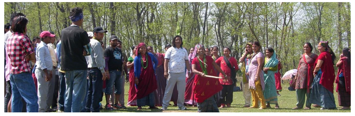
Local women team competing with male team which is rare in Nepal

Dandibiyo is the national game of Nepal however no formal competitions are organized in the country. This game needs revitalization in the country and this competition during the festival was a great start for this cause. A total of eight teams participated in the event. Sharanpur yuva samuha, Gumba chaur yuva samaj and Jai Buddha ama samuh stood first, second and third respectively.